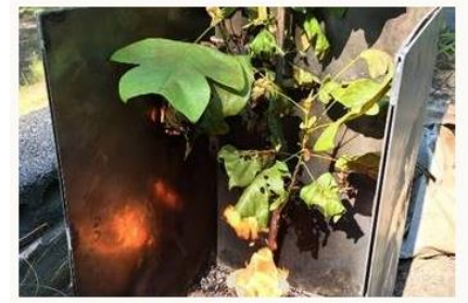
After Fire, Red Oak Seedlings Resprout