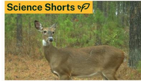
Targeted Deer Removal Can Reduce Deer-Vehicle Collisions